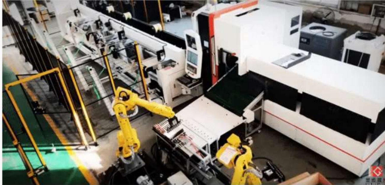
Europe client production line