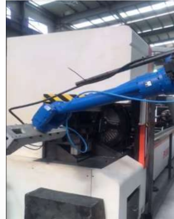
Europe client automation